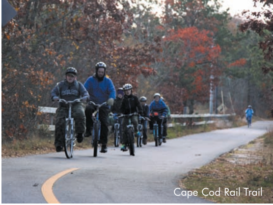
Cape Cod Rail Trail

Additional conservation information is available at the Town website ( www.town.orleans.ma.us ) under Conservation Commission.