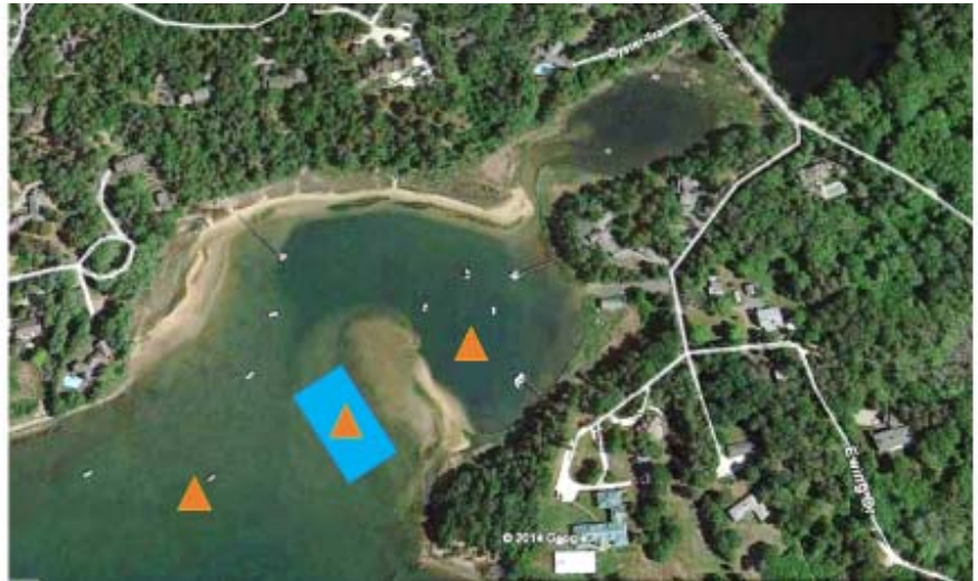
Figure 6 - Quanset Pond Demonstration Monitoring Locations