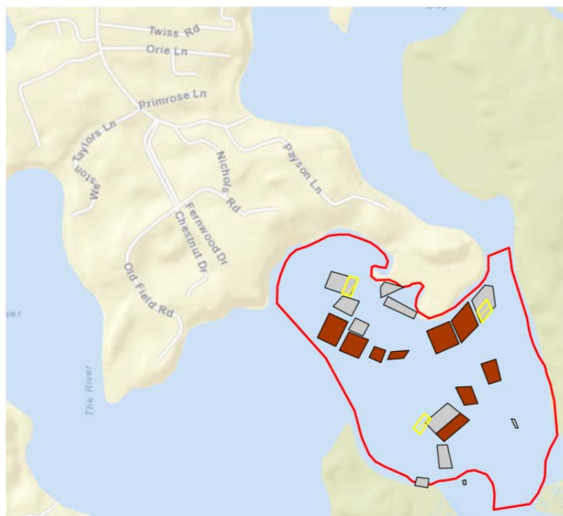
Figure 4 - Current Shellfish Grants

The plan for Little Pleasant Bay is to first work with growers to evaluate current growing practices and opportunities for improving these systems over the short and long term, then to determine a total number of shellfish that can be grown and harvested annually for all grants combined. Figure 4 shows the locations of the current shellfish grants in Little Pleasant Bay. Establishing baseline water quality conditions in this growing area will inform this process, and help quantify impacts from any increases in shellfish density. Section 5 details the baseline monitoring program for this demonstration.