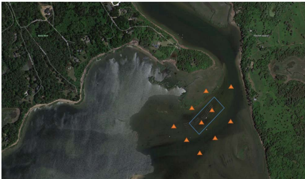
Figure 7 - Map of Recommended Sampling Stations for the Little Pleasant Bay Demonstration