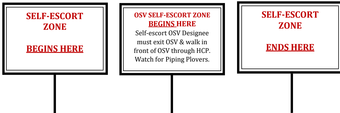
Figure 2: Example showing two (2) separate self-escort zones. While you proceed through the self-escort zone, be aware that piping plovers are very territorial. Consequently, the broods may be separated, so each escort zone may contain one (1) brood with up to four (4) chicks and two (2) adult plovers. If they are close together there will only be one (1) self-escort zone. Plovers may be moving throughout the habitat area as you are walking and driving through the self-escort zones. They can appear at ANY TIME and ANYWHERE.

*REMEMBER* that the location of these signs can change daily and it is your responsibility to identify the locations daily.